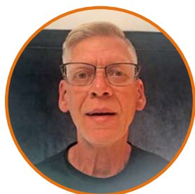
John Banks Elementary School Custodian